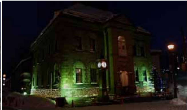
Night scene Otaru

Day 13 Sapporo Otaru : Otaru is small beautiful old town more than 80 years old. Many old warehouses & former office buildings by shipping and trade companies give Otaru's city center a special character reminiscent of past decades. We walk around the