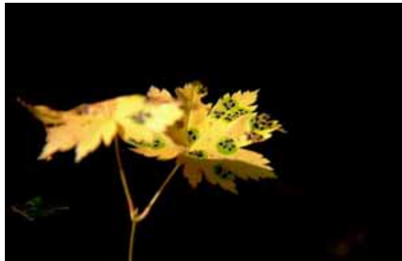
Shiretoko National Park

Day 9 Asahikawa : Heading to Asahikawa. Asahikawa is well known for its zoo, Asahiyama Zoo, one of the best Zoo in Japan. After lunch, visit Brewery. It also famous for its Asahikawa Ramen. O/N Asahikawa.